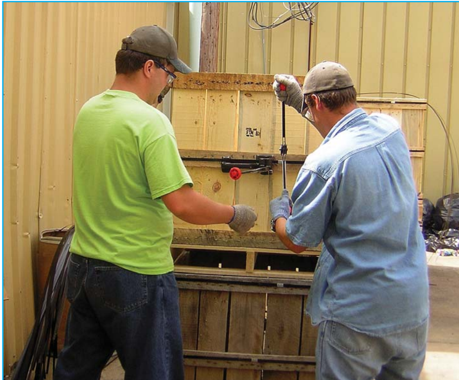
Workshop services include contracts with individual businesses, as well as community wide programs such as recycling.

It’s a formula that is a proven winner for Missouri and Missourians.